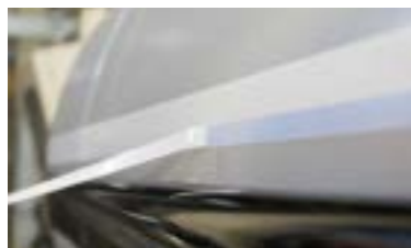
2nd step: Remove the narrow liner