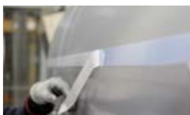
4th step: Remove the wide liner from tape