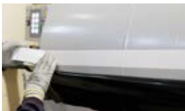
1st step: Apply the tape on the new roll