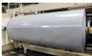
5th step: New web-material is ready for flying splice.

Automated flying splice process will continue and tape will split allowing new web-material to continue through press and coating process.