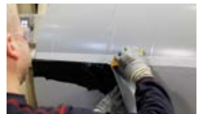
3rd step: Reverse wind substrate back on itself and apply it on the adhesive part. Then remove the overlapping excess substrate.