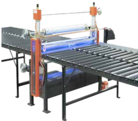
I-Walco: Horizontal Laminator