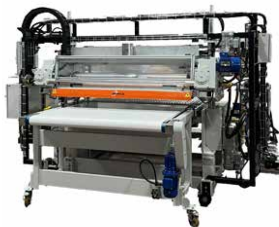
ACU-PUR: Roller Coater