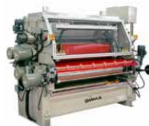
HGS: Hot Melt Application