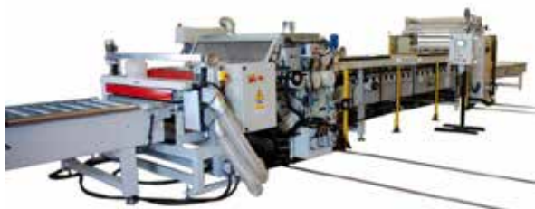
Complete gluing and laminating line