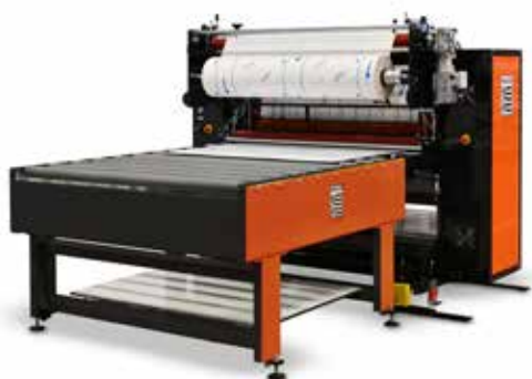
TX precision: Horizontal Laminator